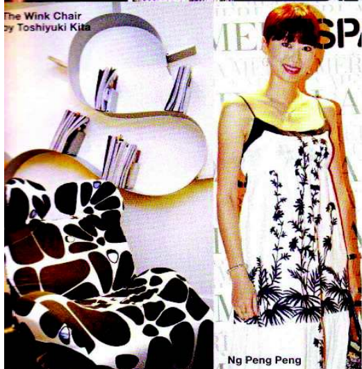
The Wink Chair by Toshiyuki Kita