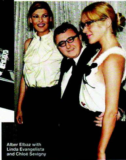
Alber Elbaz with Linda Evangelista and Chloe Sevigny