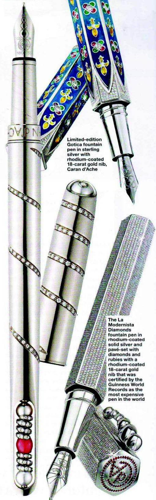
Limited-edition Gotica fountain pen in sterling silver with rhodium-coated 18-carat gold nib, Caran d'Ache

The Perles de Caran d'Ache, the house's very first limited-edition pen devoted entirely to women in 18-carat white gold with diamonds and Akoya pearls retails at RM288,000