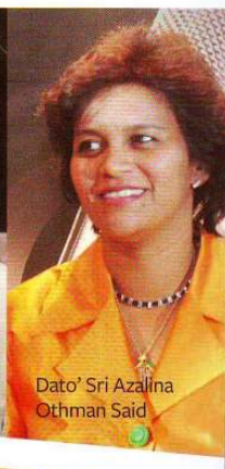
Dato' Sri Azalina Othman Said