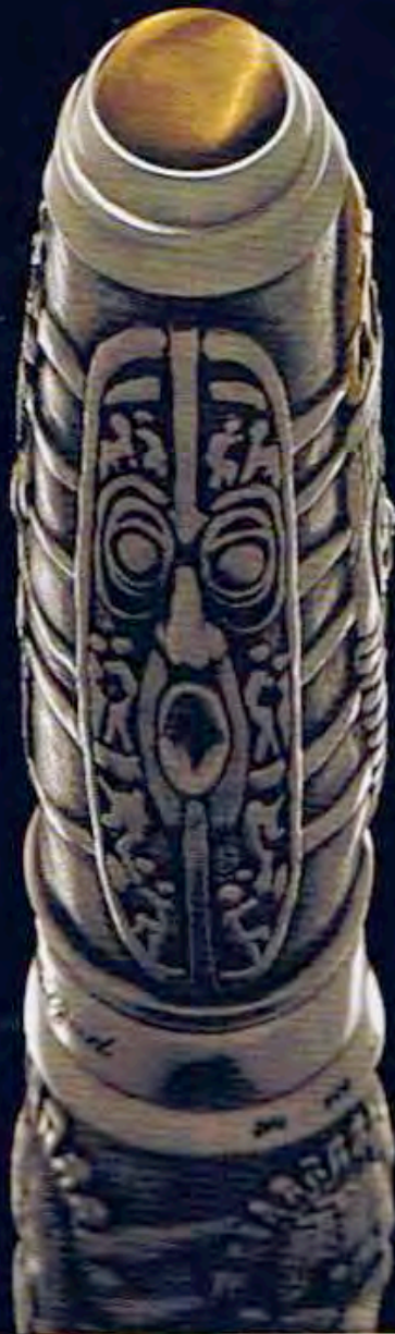
The Caran d'Ache Tribal African Masks Limited Edition is a sculptural masterpiece