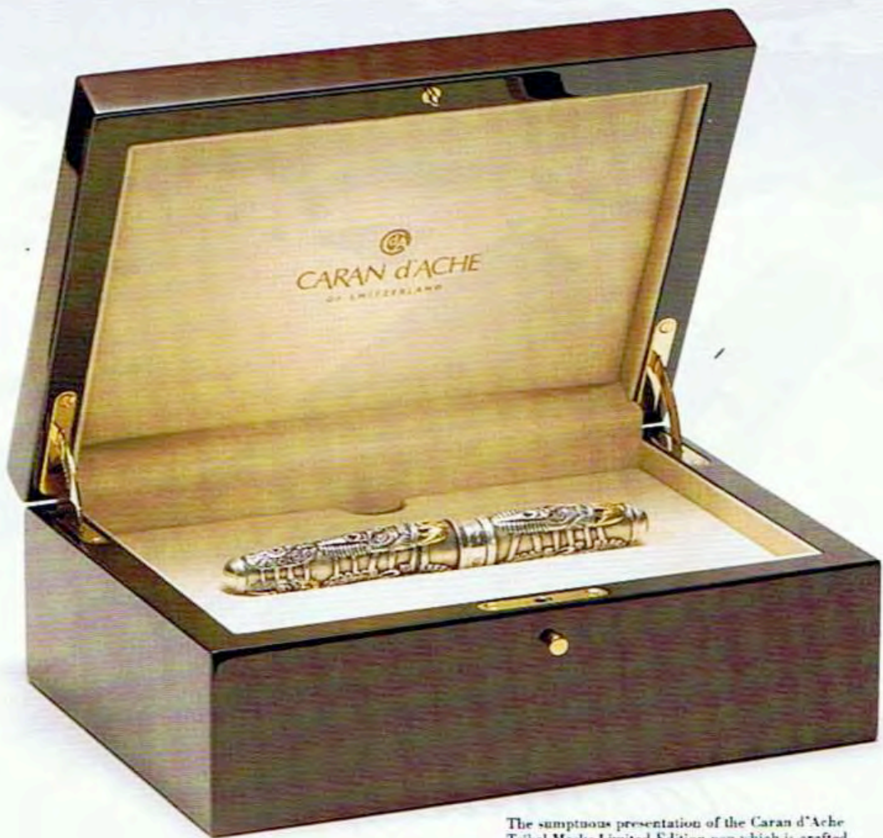
The sumptuous presentation of the Caran d'Ache Tribal Masks Limited Edition pen which is crafted of .800 silver with gilded detailing

representation. The largest land animal alive today, the elephant is symbolic of strength, wisdom and majesty.